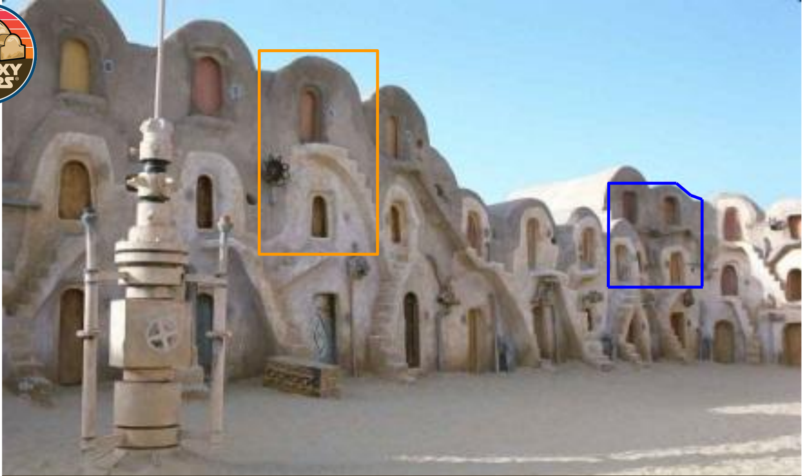
Composited Background Ksar Footage | Sequence #1 Composited footage: Ksar Ommarsia (northwest + northeast walls)